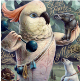
Femke Hiemstra, El Gigante (detail) , 2011, mixed media on book cover, 7.3" x 9.8"